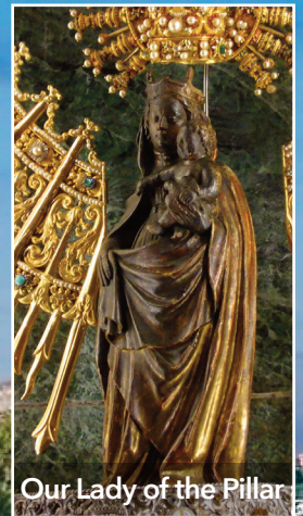
Our Lady of the Pillar